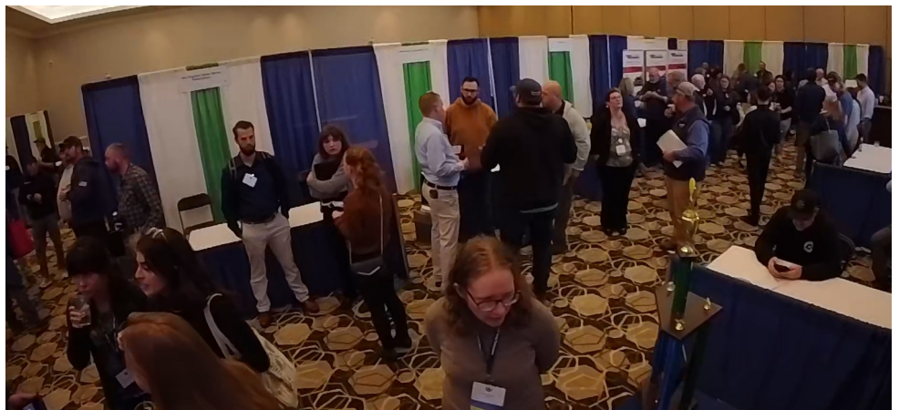
Exhibit hall, 2025 Expo

2025 was such a thrilling year working with you all. I am beyond excited to see what 2026 will bring.