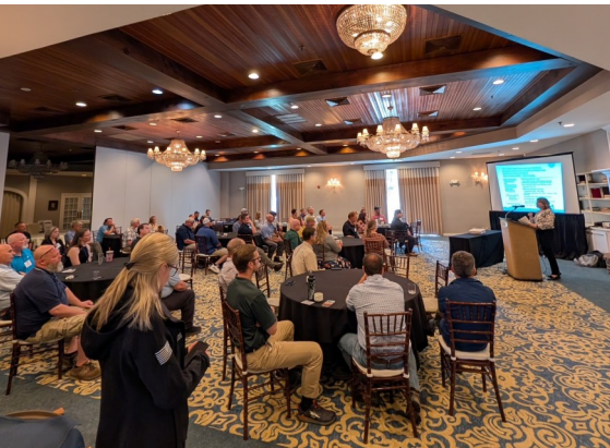
2025 Leadership Summit at Church Landing in Meredith in June.

This year we hosted our second annual Leadership Summit along the shore of Winnepesaukee. Even though this was our second go at this event, I was extremely nervous about this day. As it turned out, this event went amazingly well. This year we focused on workforce retention. We had messages