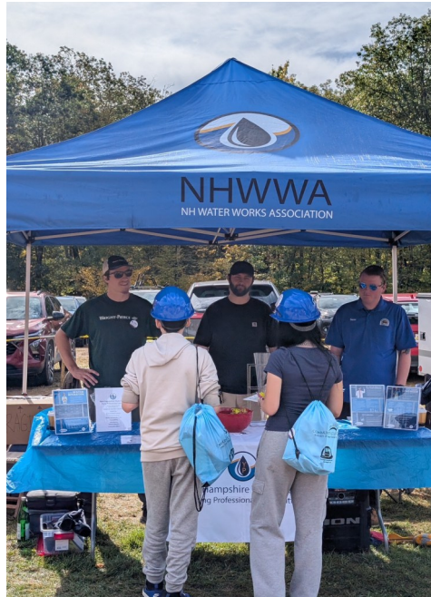
Members of the NHWWA YP Student Outreach Committee talk with students at the NH Construction Career Days, an event held for high schoolers each fall.

Our mission remains steadfast; the Young Professionals’ mission statement aptly encapsulates the direction our association intends to pursue— Reaching. Teaching. Connecting.