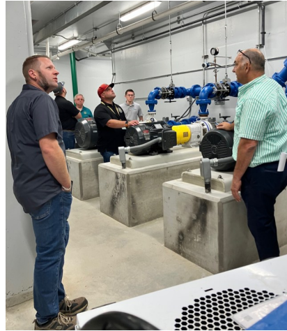
Construction Day in Peterborough, August, 2025.

from all of our federal delegates and our new Governor Kelly Ayotte. We are so grateful for their taking time and addressing our group on this day, essentially thanking all of you for all that you do for the future of the communities you serve. In 2026 we will move this event back to August. Be on the lookout for a 'Save the Date' email soon. Plan to join us to get federal and state legislative/regulatory updates, an extremely good lunch, and an opportunity to enjoy presentations