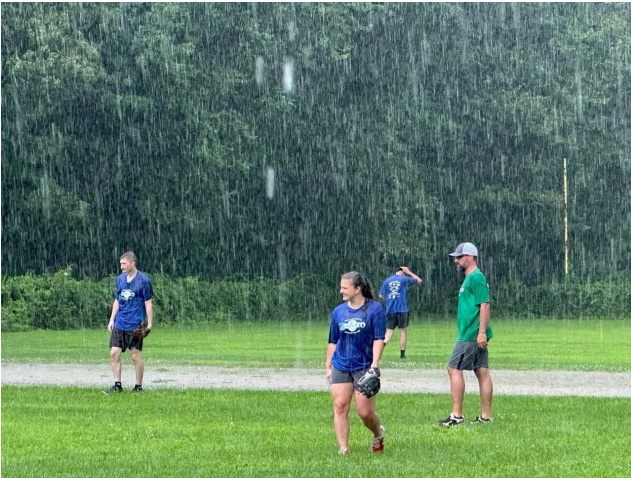
A soggy but fun second annual Blue vs Green softball game was held in July. Thanks to everyone who came out to play!

Don't forget to register for the Merrimack River WTP Treat and Meet in Manchester! We hope to see you there! For the most current information check out our social media pages! You can also find us at https://nhwwa.org/young-professionals/