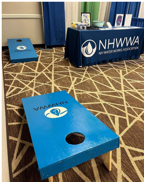
Right: The YPs added cornhole toss to their booth at this year's Expo.

Don't forget to follow us on social media to keep up-to-date with all that the YPs have planned!