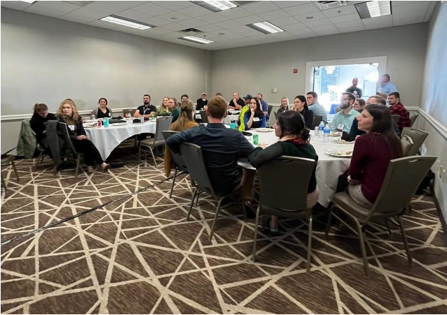
The annual YP Luncheon at the NH Drinking Water Expo and Trade Show included a game of Drinking Water Jeopardy!